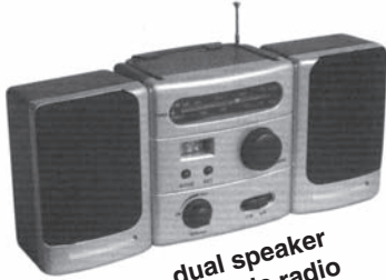
dual speaker portable radio

Basic: $75.60 Plus: $110.58 Tax included